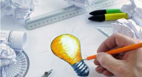
Nationally, 45 per cent of firms report being 'innovation active'

London and Manchester are way behind Oxford, Liverpool and Teesside in a 'league table' of UK areas creating new goods and services, according to research.